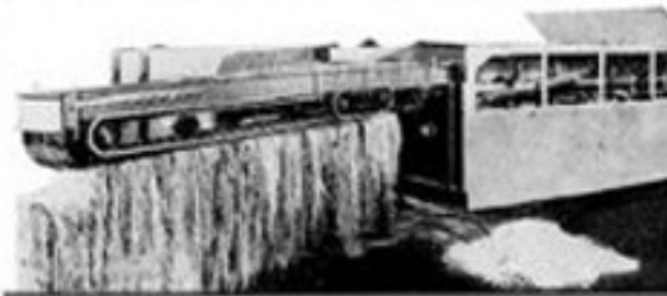
Top, sailing the seas with sails and rope made of hemp. Bottom, hemp fiber being delivered from machine ready for baling. Pile of pulverized hurds beside machine is seventy-seven per cent cellulose

Machines now in service in Texas, Illinois, Minnesota and other states are producing fiber at a manufacturing cost of half a cent a pound, and are finding a profitable market for the rest of the stalk. Machine operators are making a good profit in com-