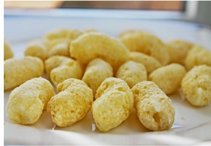
Healthy Snacks – Q4 2017