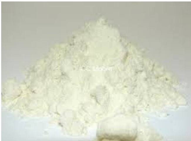
Protein – Q4 2017