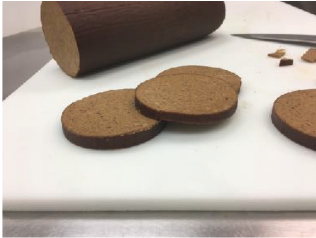
Meatless – Q3 2017