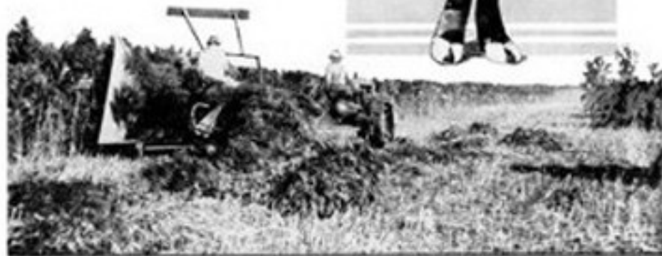
Top, modern version of linen duster made from hemp. Bottom, harvesting hemp with a grain binder. Hemp grows luxuriously in Texas